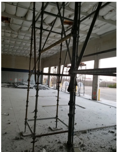
PG&E- Herndon Substation (right pictures)

__Joe and his crew demolished and installed new piers. They also removed an old section of the substation quickly and safely. They worked under a clearance and a small time frame and made it happen!