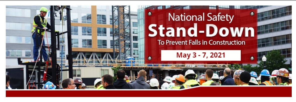
May 3-7^{th} is National Stand-Down week. We will be taking time each day to recognize fall hazards and prevention. We'll end the week Friday afternoon with a meeting and BBQ.